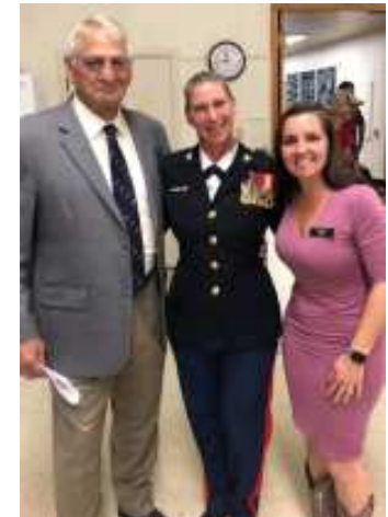
On Thursday I was honored to attend the Veterans Luncheon at the Elks Lodge