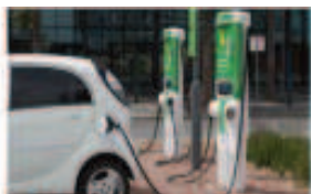
Add EV Charging Countywide