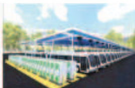
Help MTA Go Solar Electric