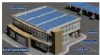
Solarize Local Government

Mendocino Transit Authority (MTA) to convert as much as possible to electric vehicles. Converting the public transit system fleet provides an excellent one time capital investment consistent with grant nature of American Rescue Act funding. The Grassroots Institute further urges the City and MTA explore how smaller more efficient electric vehicles might be used to expand services routes at the same or reduced cost.