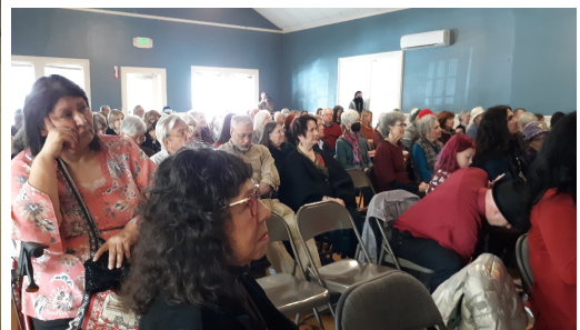
Standing Room Only