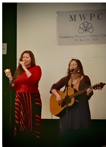
The Real Sarahs